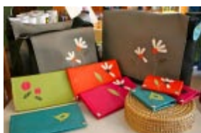
HAPPY COLORS AT SUNNYSIDE

Great gifts. Wander through the downtown shops and you'll see lots other interesting gift possibilities, such as these night-lights made from recycled glass at Dragonfly and a collection of colorful wallets and bags at Sunnyside.