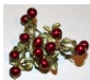
BROOCH AT JOIE DE VIVRE