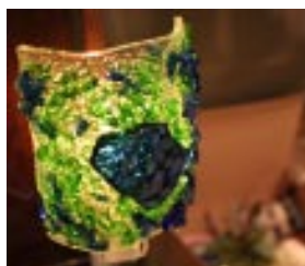
NIGHT LIGHT AT DRAGONFLY

Get planting. One gift lots of moms love—help in the yard. Stop by Simmons Center Market for a wide selection of annuals, perennials, shrubs, mulch, and more—and then do the work for her. And don't forget to stop by participating shops 5-9pm, Second Saturday, May 8, to pick up free flowers. See page 1.