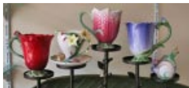
FUN TEACUPS AT A FEW OF MY FAVORITE THINGS

Looking for some great Mother's Day ideas? Try a few of these right here in downtown Cambridge!