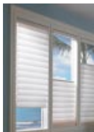
HUNTER DOUGLAS BLINDS

For the crab lover. Whether your mom is close by or lives out of town, let her enjoy some Maryland crabs. Pick them up steamed at J.M. Clayton's, Kool Ice & Seafood, or Ocean Odyssey (all of them Main Street members). Ask about shipping live crabs to out-of-town moms.